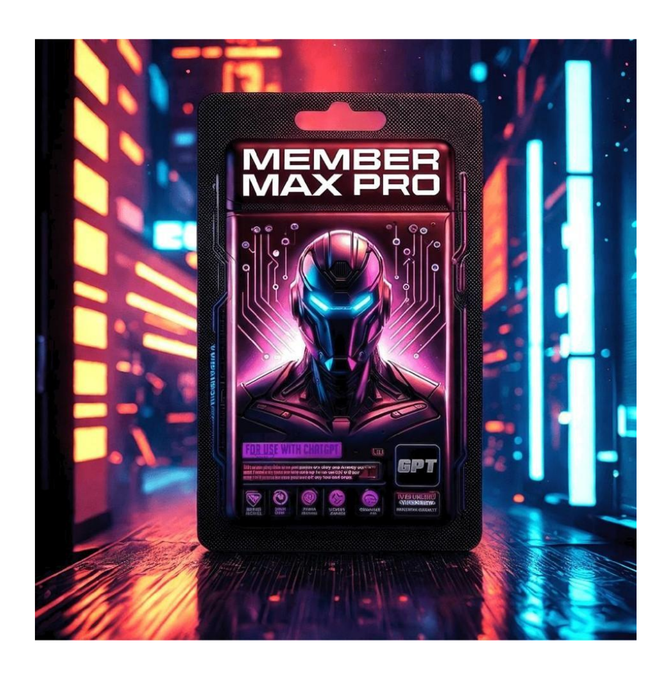
Member Max Pro User Guide